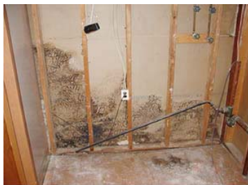
Toxic Mould hidden in the walls of a house.

After many years of exposure, you need to be patient, it may take many months for your body to completely eliminate the toxic effects.